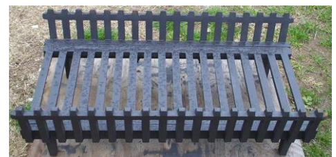
Large U-shaped firebasket