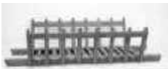
U- shaped fire basket

Normally they are freestanding on fireplace hearths.