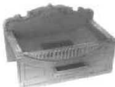
Metters Open hearth fireplace