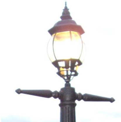
Ladder rack option fits a Medium shaft only Total length 830 mm