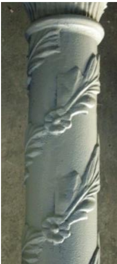
Plain Shaft Option 1 Grapevine Single twist Max length 1500mm & requires a long medium base option.