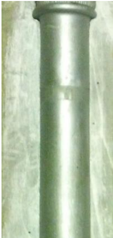
Plain Medium shaft