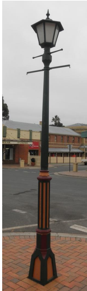
Junee Lamp post Pattern using 17A base and Junee tapered Fluted shaft