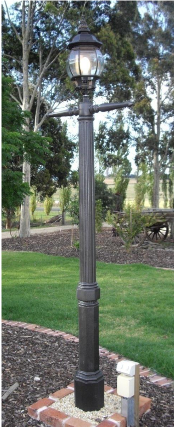
Lamp post with ladder Rack using a Medium Fluted shaft and Base 12A