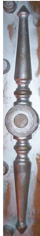
Ladder rack pattern